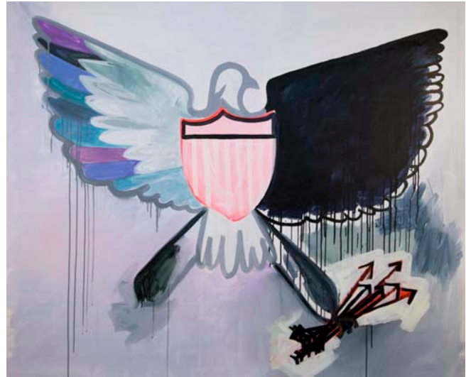
Promiseland , 2011 acrylic on canvas 58" x 66"